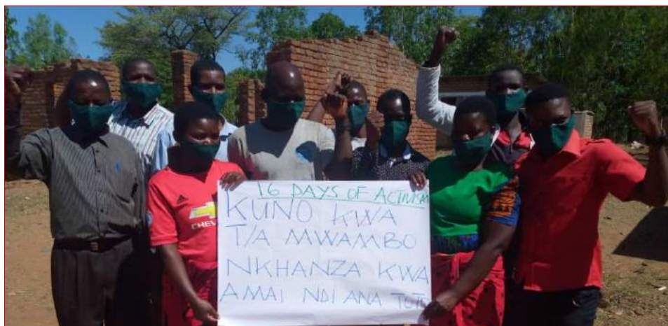
Malawi EMPOWER Project in partnership with the district council officials organized training for the community cadres in identifying and being responsive to violence in SRH/HIV programs in both Zomba and Machinga districts from 13 th to 14 th November 2020. In the picture, Zomba district participants sending a message denouncing gender-based violence. The message says that people from TA Mwambo area are saying no to violence against girls and women.