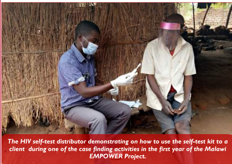
The HIV self-test distributor demonstrating on how to use the self-test kit to a client during one of the case finding activities in the first year of the Malawi EMPOWER Project.

When Malawi EMPOWER Project organized HIV self-test distributors training from 14th to 17th July 2020 in Zomba district, the training was meant to equip the participants with knowledge and skills on how to demonstrate and distribute HIV self-testing kits in their health facility’s catchment areas while at the same time linking the clients to treatment and care.