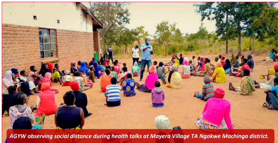
AGYW observing social distance during health talks at Mayera Village TA Ngokwe Machinga district.

However the situation started improving. The country towards the end of June 2020 saw the ban on meetings and workshops being lifted. This paved way for the resumption for the opportunity to roll out training sessions for HIV-ST distributors, of course, while abiding to Covid-19 guidelines. The project anticipated an increase in the number of trained distributors at district level. With the lifting of the ban the project continued to work with One Community that had recently resumed club activities to mobilize more AGYW to access services and will continue to work with other implementing partners that support HIV-ST. ■