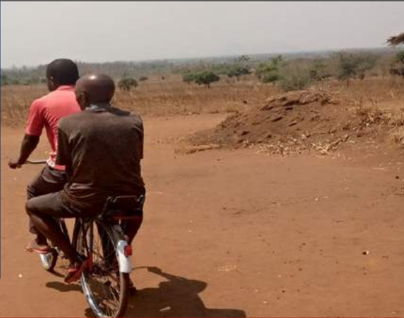
The HIV self-test distributor escorting the client to Ngwelero health facility for confirmatory test after testing positive through self-test

“It was disturbing, but the counseling helped ease my fears,” he says as he recounts the events of the day he tested positive for HIV.