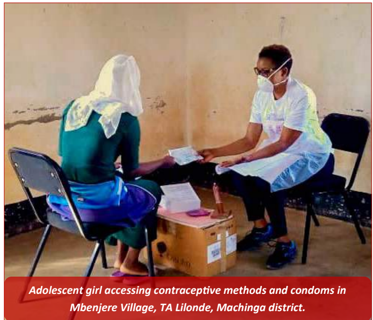
Adolescent girl accessing contraceptive methods and condoms in Mbenjere Village, TA Lilonde, Machinga district.

Empowering communities to prevent Gender-Based Violence among AGYW.....p.7